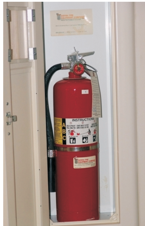
FIGURE 5. Fire extinguishers should be readily available.

Fire extinguishers should be located in clean, dry areas that are easy to access. They should be hung so the top is between 3½ and 5 feet above the floor and must be quick and easy to remove. Their locations should be clearly marked, and everyone familiarized with their locations and use.